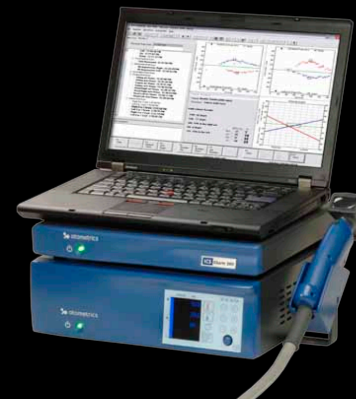
Small footprint - ICS AirCal stacked with Otometrics' VNG/ENG solution

Irrigation with the ICS AirCal provides a modern choice for gold standard caloric irrigation. It combines the convenience and patient comfort of air, with the precision of water irrigation enabling you to do caloric testing with confidence. With no water to catch, the entire irrigation process is easier for the clinician and more pleasant for the patient.